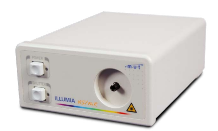
Light source Illumia VIS/NIR

地址:深圳市深南中路2066号华能大厦712室 电话: 0755-83680810 83680820 83680830 83680860